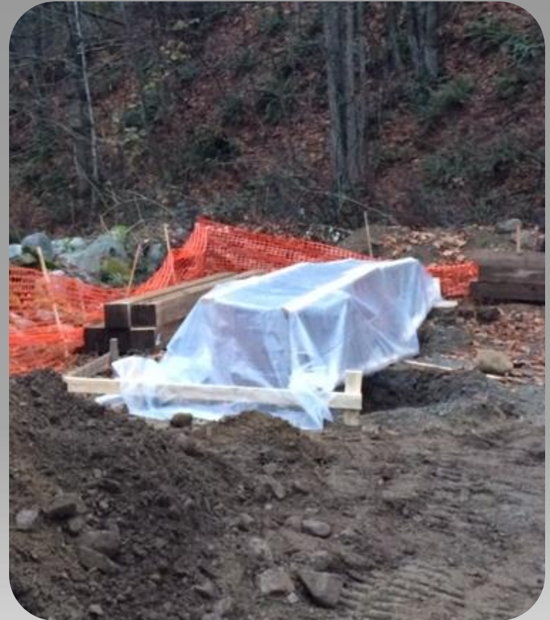
Step 1: Digging the holes for the rebar cages and concrete footings