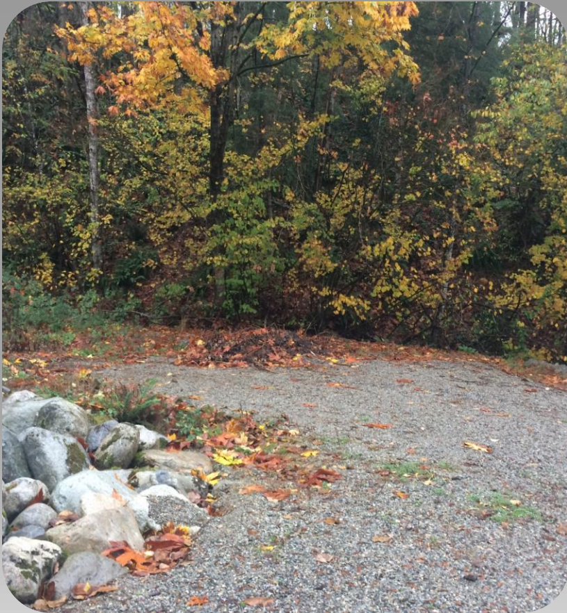
This is our building site