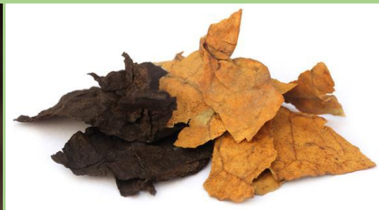
With thanks, this pic comes from: https://www.leaf2smoke.ca/ceremonial-.html